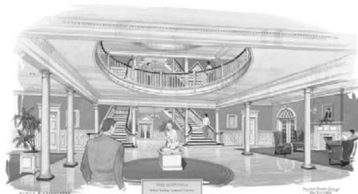
Rendering of the inside of Ruffner Hall

While the building itself was declared unsalvageable after the fire, an original mural and several medallions that would have been extremely costly if not impossible to recreate, had been removed and stored off-site during renovation, guaranteeing their survival.